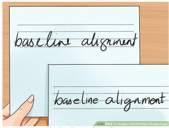
Fig:3.1:Types of Baselines:

The technique that would be used to determine baseline, in this paper is polygonolization. In this method the smallest possible polygon around the line to be examined is drawn. This polygon should cover every point on the line. The slope of various sides of this polygon will help us identify the baseline.