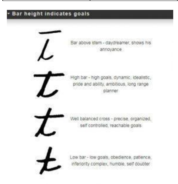
Fig3.3: Types of 't'bar: